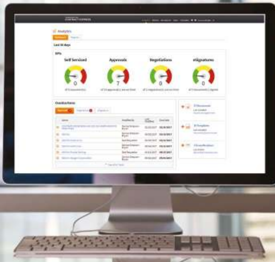
Contract Express Analytics dashboard